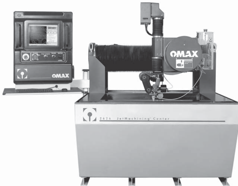
Shown with Tilt-A-Jet® Accessory.