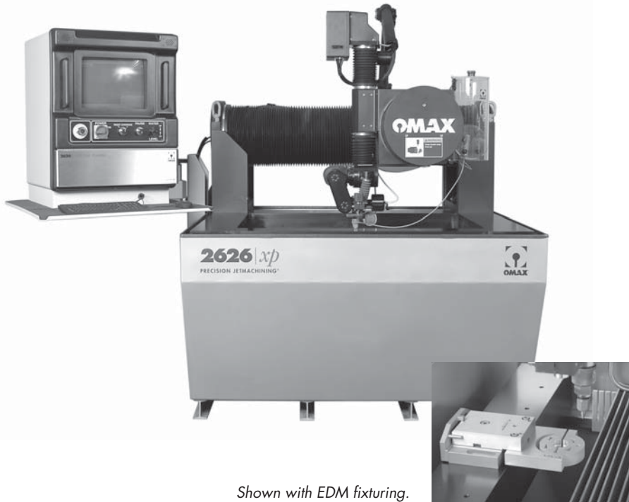
Shown with EDM fixturing.